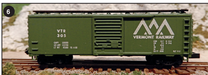
Atlas part # 5002-129, Vermont Railways # 305