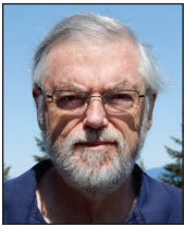
by Steve Stark

Soon after N Scale was introduced to North America in 1964, some manufacturers briefly sold their single cars in completely enclosed boxes. The jewel cases were in the future. Arnold Rapido, Aurora (Minitrix 1 ) and Atlas all used enclosed boxes (photos 1, 2). The Arnold Rapido model 0483A (photo 3) and Aurora model 4880/260 (photo 4) date from circa 1968, while the Atlas kit 5002-129 dates from 1968 2 (photos 5, 6).