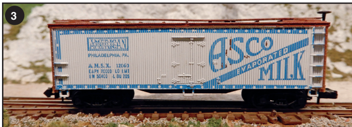
Arnold Rapido part # 0483 A, Asco Milk #12060