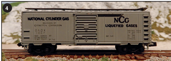
Aurora (Minitrix) part # 4880/260, National Cylinder Gas # 1007