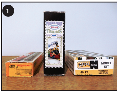
Arnold Rapido part # 0483 A, Aurora (Minitrix) part # 4880/260, Atlas part # 5002-129