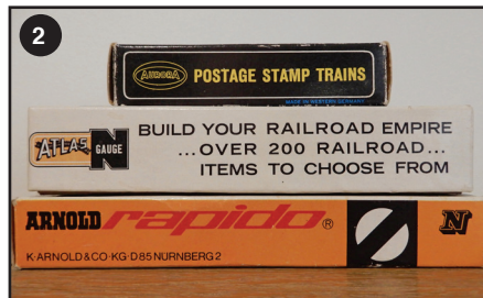
Arnold Rapido part # 0483 A, Aurora (Minitrix) part # 4880/260, Atlas part # 5002-129