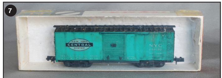
Arnold Rapido part # 0412, New York Central 259180