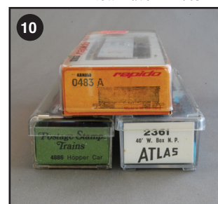
Arnold Rapido part 0483 A, Aurora (Minitrix) part 4886, Atlas part 2361