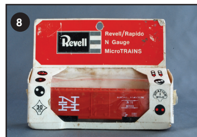
Revell/Rapido part # N2503, New Haven # 4003