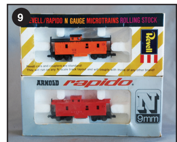
Revell/Rapido part # N-2597, Western Pacific caboose # 754, Rapido part # 0481 S, A.T. & S.F. caboose # 1957